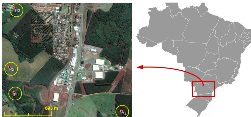
Figure 1. Map of the study area, location of sampling points, identified by circles, in Araçongas, Paraná, Brazil (Google Earth, Jul 25, 2017)

The collected samples (4 L) were filtered, in 0.45 \mu\text{m} GF-3 glass-fiber filters (Macherey Nagel), to eliminate the particulate matter originated from the matrix. For the SPE procedure, C18 cartridges were conditioned, under vacuum, with 10 mL of acetonitrile and 10 mL of ultrapure water at a flow of 1 \text{mL min}^{-1} . During the conditioning, it is important to avoid the drying of the cartridge. Then, 250 mL of surface water sample was added to the cartridge, with a flow of 6 \text{mL min}^{-1} using a manifold (Agilent Technologies). Subsequently, the cartridge was washed with 5 mL of ultrapure water to remove the interferences from the matrix, and dried under vacuum for 30 minutes to remove the water.