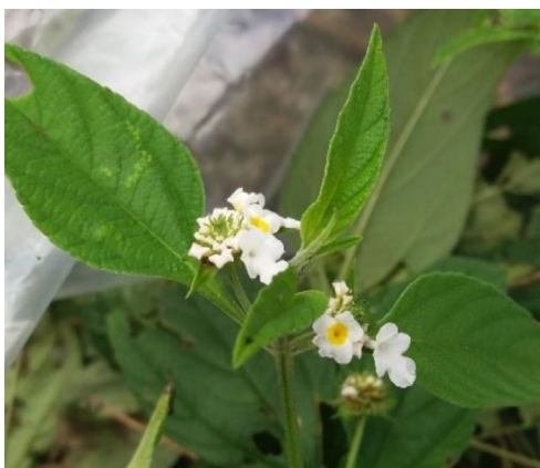
Figure 1. General aspect of the floral branch of Lippia alba (Mill.) N.E.Br. ex Britton & P.Wilson

The genus Lippia L. has approximately 200 species of herbs, bushes, and small trees. Their major centers of dispersion are concentrated in countries of the Southern Hemisphere and some tropical regions of North America and Australia. Essential oils from Lippia spp. contain a wide variety of volatile constituents with a range of pharmacological properties, particularly antimicrobial activity 10 . Lippia alba (Mill.) N.E.Br. ex Britton & P.Wilson (Figure 1), popularly known as erva-cidreira, is used in folk medicine in the form of infusions made from the flowers, leaves, stems, and roots to treat dermatological diseases as well as gastrointestinal and respiratory disorders; pharmacological studies have demonstrated the promising biological activities of this plant, such as its antibacterial, antifungal, antiviral, anti-inflammatory, antioxidant, sedative, cytotoxic, analgesic, antipyretic, anti-hypertensive, antispasmodic, and anti-Leishmania effects 11-18 .