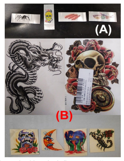
Figure 1. Examples of the analyzed adhesive tattoos: (A) temporary tattoos present in bubble gum and (B) temporary adhesive tattoos on cards