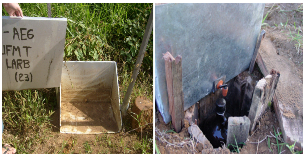
Figure S2. Photo and scheme illustrating runoff collectors.