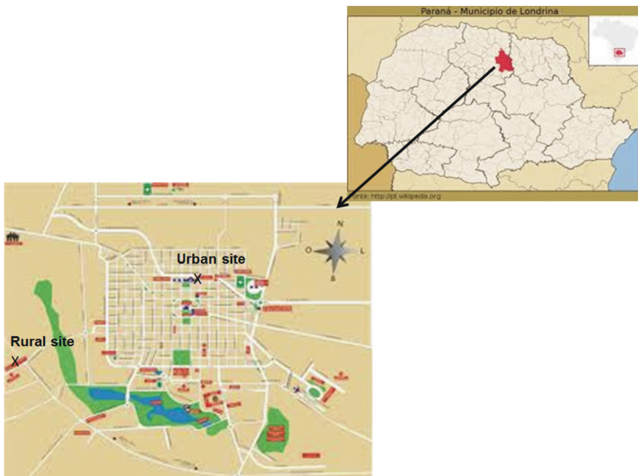
Figure S1. Location of the sampling sites in Londrina City: urban (downtown) and rural (farm area at State University of Londrina).

b Universidade Tecnológica Federal do Paraná, 86812-460 Apucarana-PR, Brazil