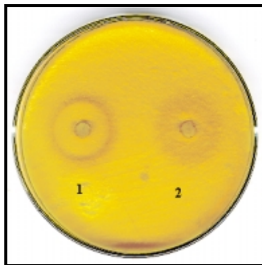
Figure 4. Disc diffusion method. 1 -Punicalagin Ø=20mm; 2- Punicalin Ø=11mm